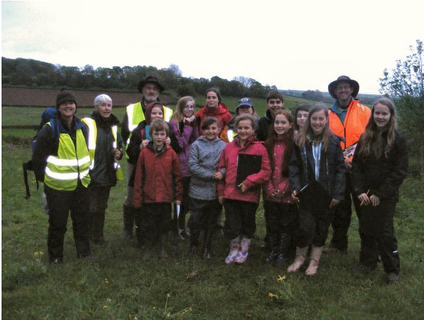
Wildlife Warriors and leaders on one of their field trips to identify flora and fauna