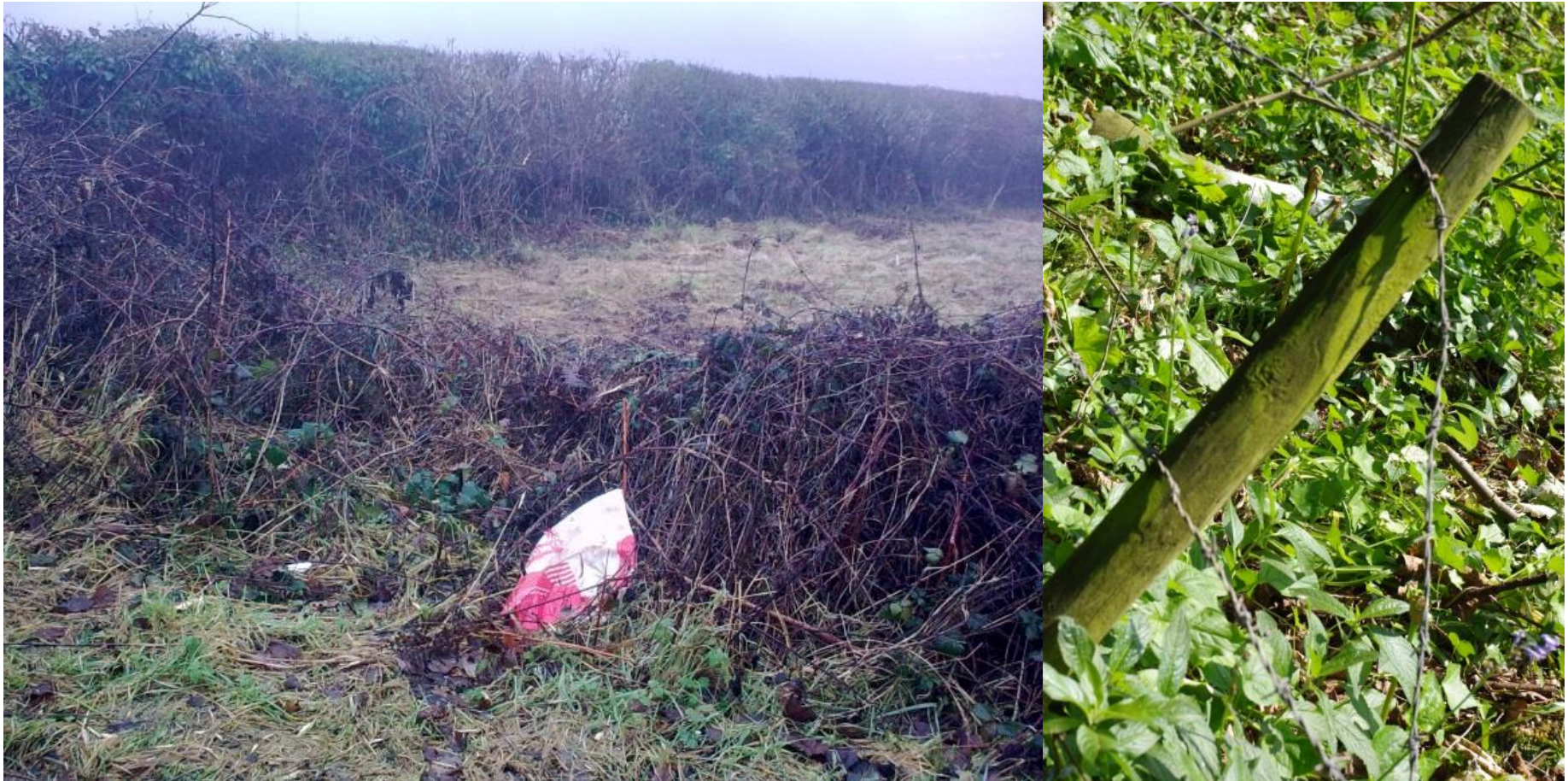
Sections of the existing stock fencing that is in need of replacement