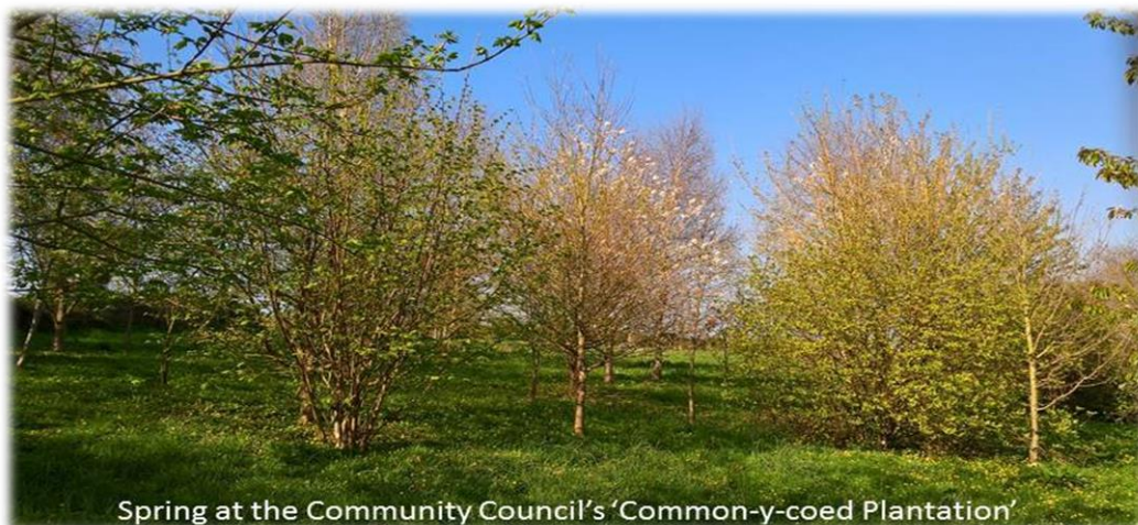
Spring at the Community Council's 'Common-y-coed Plantation'

Chair of Magor with Undy Community Council