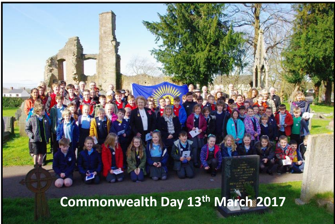
Commonwealth Day 13 th March 2017